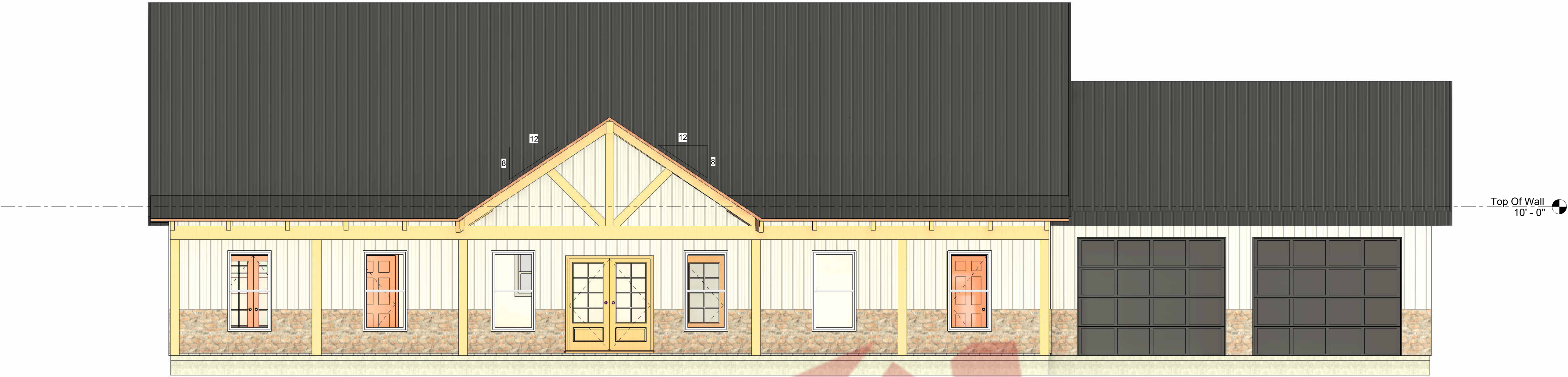
① Front Elevation 1/4" = 1'-0"